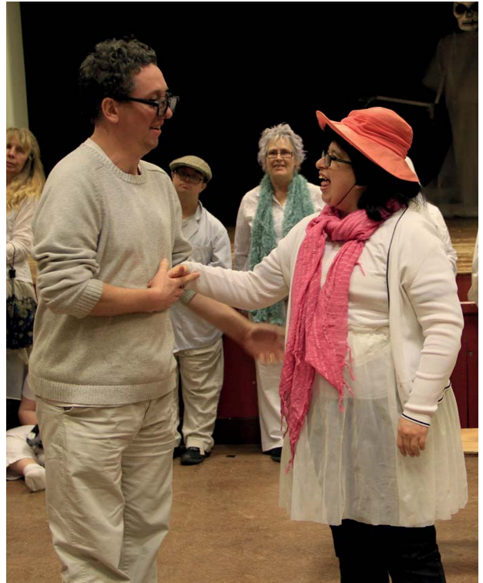
Masquerade - Arts Connection