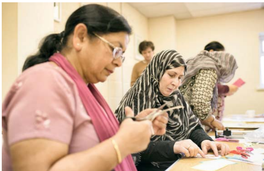
South Wales Literature Development Initiative Workshop

As with the previous year, there were more Literature participatory sessions than any other art form in 2016/17. Literature sessions made up 34.2% of all sessions run. This arts activity also had the highest attendance rate (105,548); an attendance rate that has increased by 6.9% from the previous year.